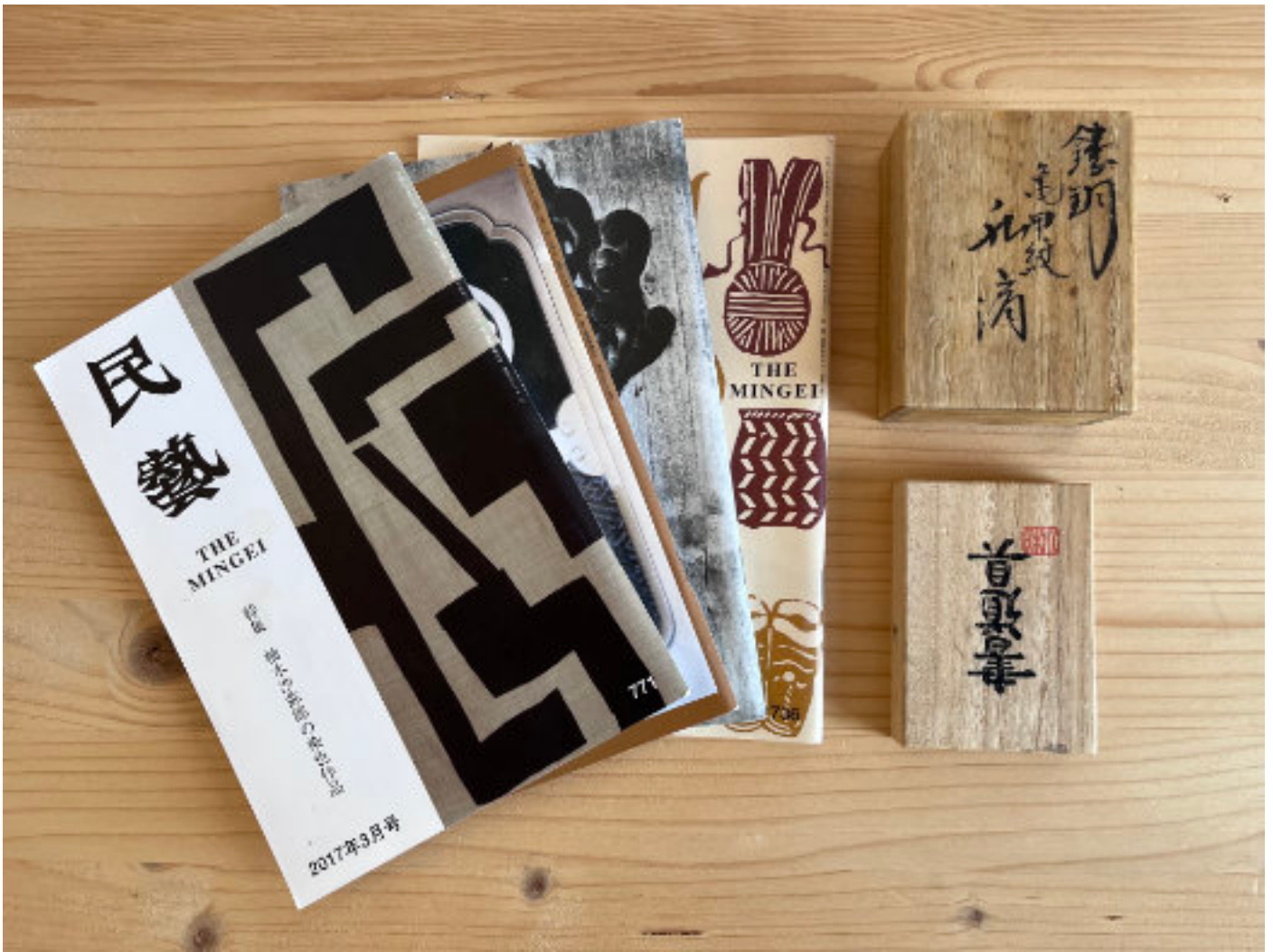
Above: The Mingei art magazine and traditional wood containers.